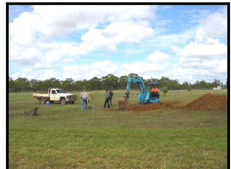
Searching for "gold" - Spitfires

Another project that I have been involved with for the past two years is the "Broken Wings" documentary being produced by the Melbourne based Artisan Films. It is a professionally produced doco about the "so called" buried Spitfires here at Oakey. I have been able to assist, along with others, to provide research and advice on the wartime history of the base. This project, at present privately funded, has been quietly moving along for the past six years and the amount of information coming to hand is amazing. Are there buried Spitfires? Who Knows? However when this project is completed the museum will have had unbelievable worldwide publicity via the History Channel and crikey, we may even have a Spitfire. Further info regarding the project can be viewed at www.brokenwings.com.au go to the Home page and check out the trailer in the black box.