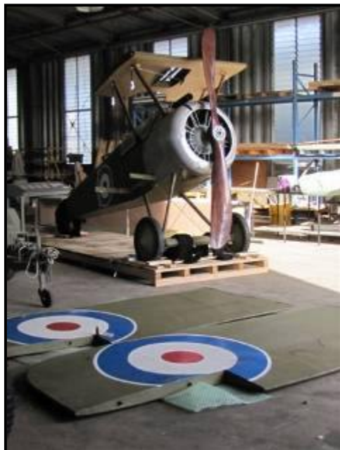
Photo left shows the Sopwith Camel after it arrived Wednesday 29 June from Melbourne