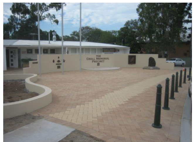
Sherwood /Indooroopilly RSL