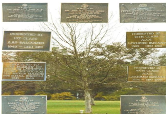
Some of the Plaques

Approximately 60 London Plane trees were planted along the entrance roadway and during the Army Apprentice School 50 th Anniversary celebrations returning class members placed brass plaques at the base of 49 trees (one for each of the classes). In addition to the intake plaques there were also 5 memorial plaques in memory of class mates who had died while on active service. The KIA plaques are collocated with the respective class plaque and tree. Importantly, it should also be recognised that trees were also planted at the front gate for the Pre-Workshop Apprentices who were Apprentices prior to the 1st Class at the Apprentice School getting off the ground in 1947.