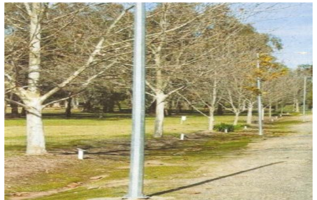
The Avenue of Honour ALTC Bonegilla

Did you know you have an Avenue of Honour at Bonegilla?