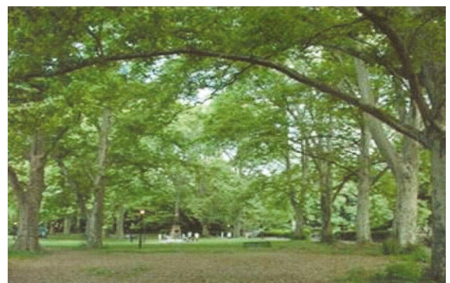
Existing London Plane Tree Grove-Bonegilla

Discussions are ongoing between the Australian Army Apprentice Association (AAAA), the RAEME HOC cell (Corps Funds) and apprentice class groups to fund the cost of purchasing 12 advanced London Plane trees and appropriate fertiliser to ensure the survival of the new trees. Discussions are also addressing the Grove management plan.